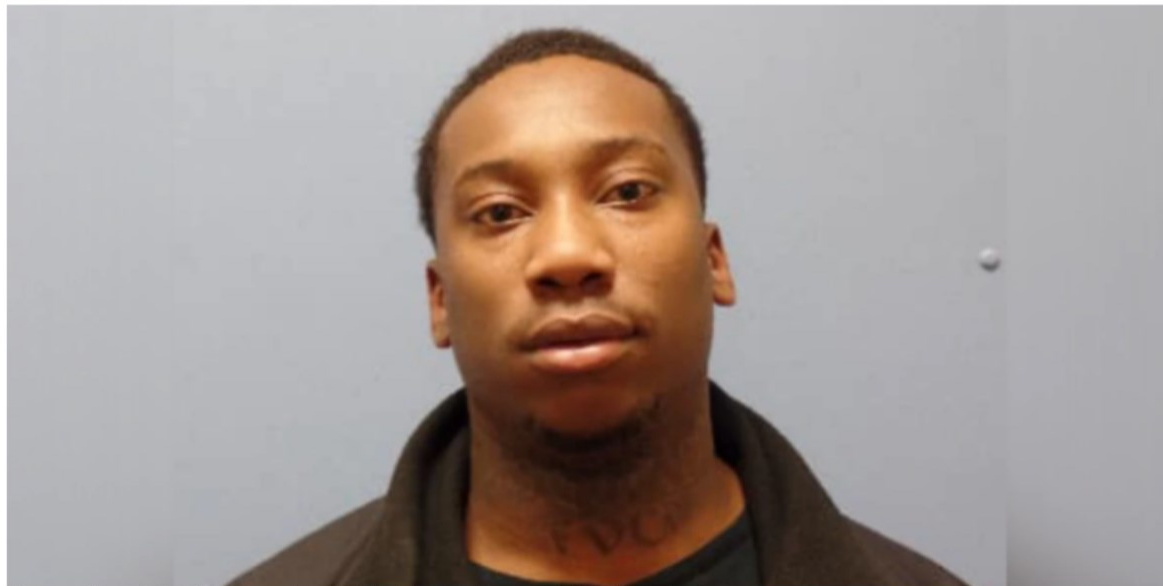
Man wanted by Sandusky Police in connection of 4 victims being shot

By Rachel Vadaj | September 28, 2020 at 12:33 PM EDT - Updated September 28 at 12:33 PM